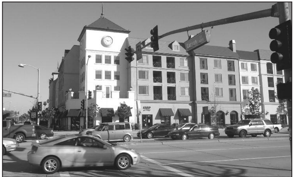
The Renaissance at City Center at the corner of Carson St. and Avalon Blvd.

The City of Carson has a balanced ethnic and cultural mix that lives together in accord and opulence. Carson is in the South Bay's "Golden Triangle" of trade – an area bound by LAX, the twin ports of Long Beach and Los Angeles, and the Alameda corridor. Carson is also intersected by four Southland freeways that make it a major gateway to the Pacific Rim. Carson's strategic position