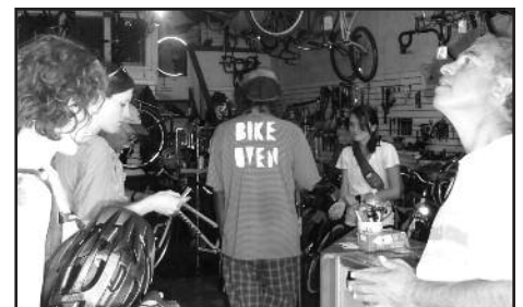
Los Angeles County Bicycle Coalition

*The Bicycle Safety session will be mandatory for all bike tour participants. You must provide your own bicycle and safety helmet to participate in the bike tour. ■