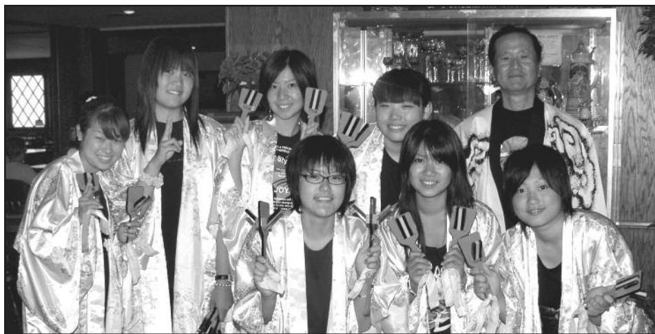
2008 Student Delegation and chaperon from Soka, Japan.

C arson Sister Cities Association (CSCA) is seeking host families for foreign students who will be visiting from Soka City, Japan this summer.